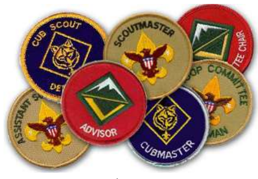
Turkey Camp 2020 Leaders Guide Page 15