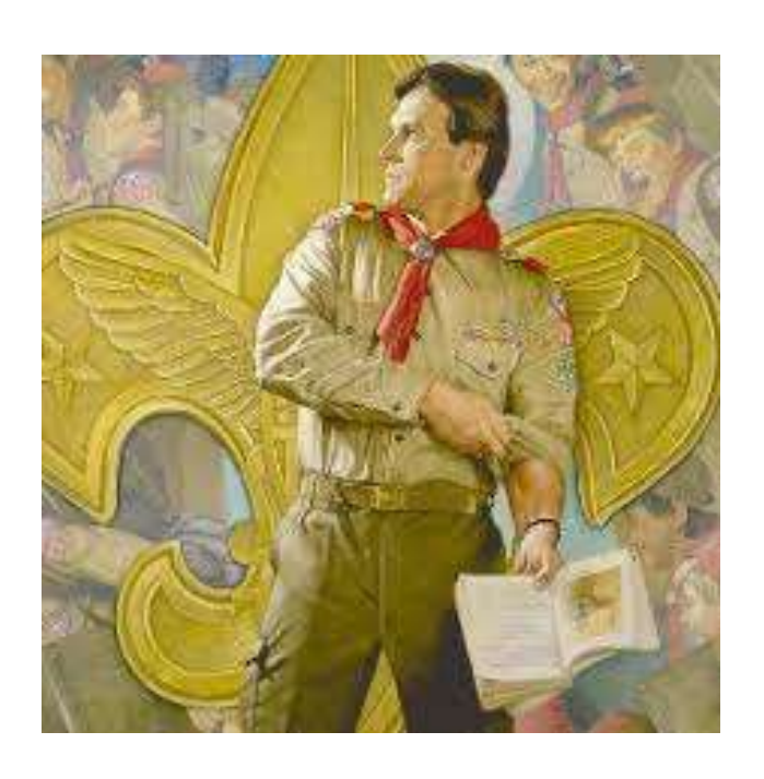
Turkey Camp 2020 Leaders Guide Page 18